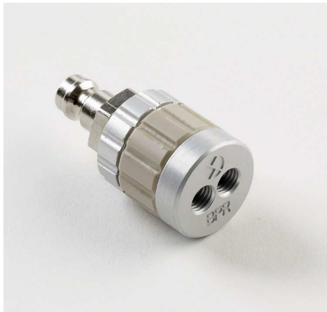
Left: Valve Chip Holder (3000138)

The Valve Chip Holder is designed to hold a chip with one etched glass layer and a removable polymer diaphragm. A gas pressure supply can be connected to the holder for pneumatic actuation of the diaphragm. The holder is supplied with a valve chip and a diaphragm. The Valve Chip can be used for back pressure regulation or as an active valve.